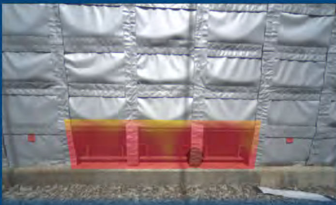
Before / After

Isotex-dB soundproofing blankets are effective in reducing noise from industrial equipment, especially at low frequencies. Having an STC 33 sound insulation index, these covers are the ideal solution for your noise problems.